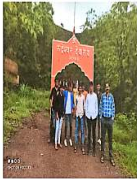
g. Cleanliness drive at Sagarshwar Temple